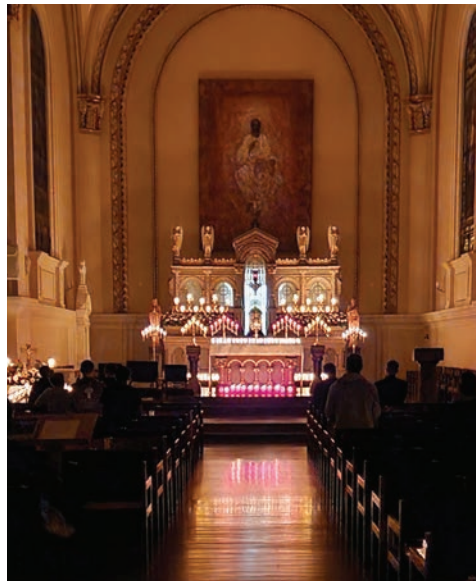
Our men pray by candlelight during an all-night vigil for the Solemnity of All Saints.