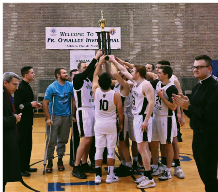
The Shoremen hoist the 2nd place trophy — our best finish in the tourney's 21 years.