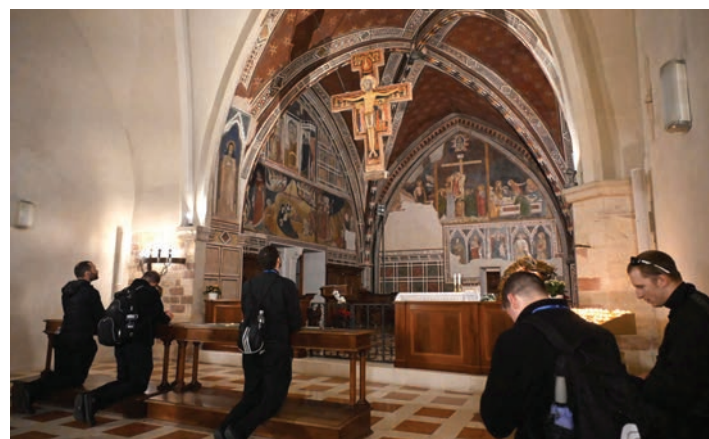
Seminarians pray in front of the crucifix which spoke to St. Francis of Assisi to rebuild the Church.