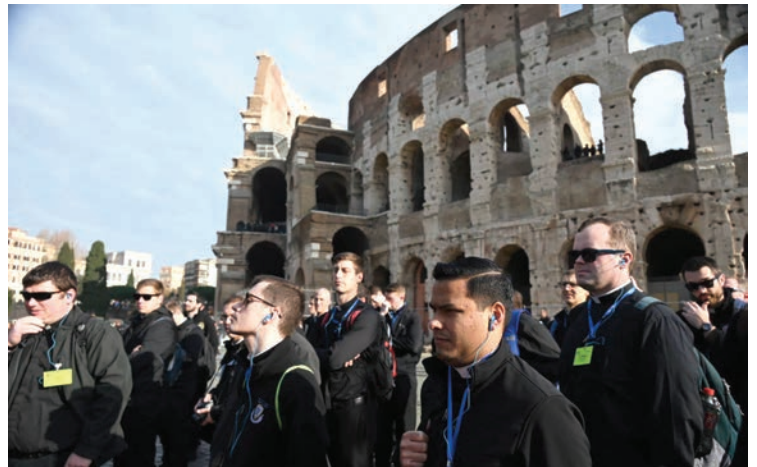
The Colosseum looms large during a tour of historical sites.