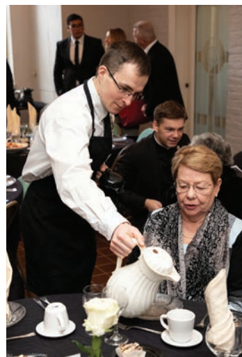
Seminarians are grateful for the opportunity to serve our faithful benefactors.