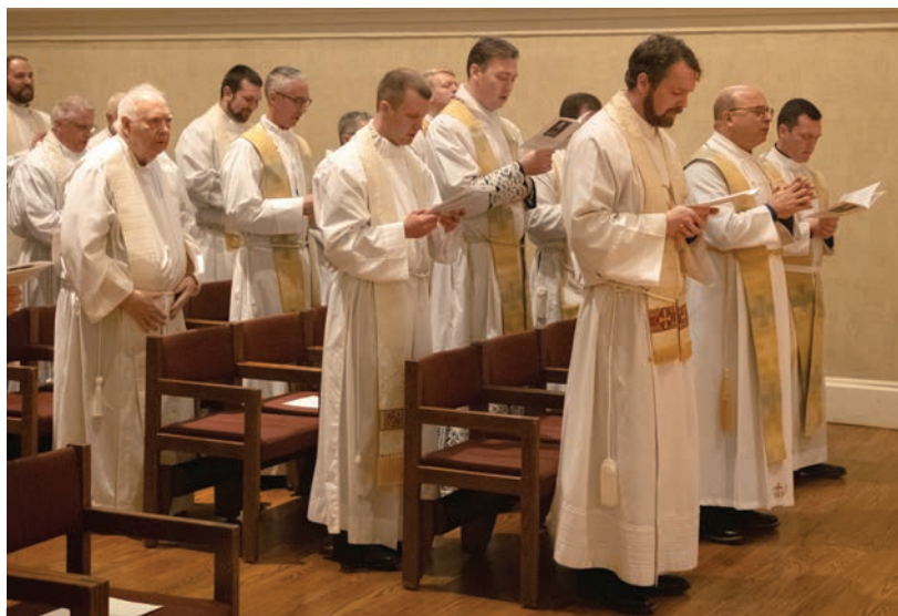
Priests gather on the Solemnity of St. Francis de Sales.