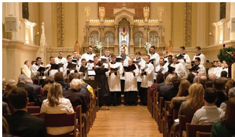
The Schola Cantorum sings hymns of praise during the Festival of Lessons and Carols.