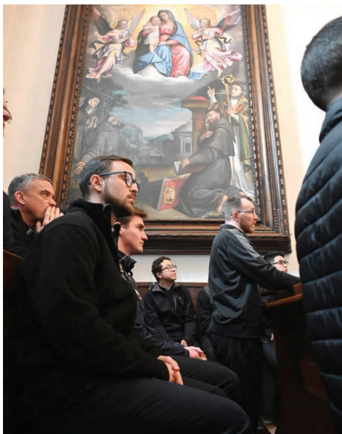
The men pray midday prayers in the Benedictine abbey after learning of Pope Benedict's death.