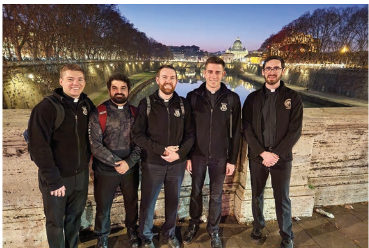
Seminarians enjoy the Eternal City.