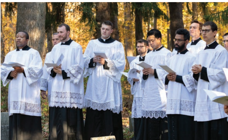
Seminarians pray for the dead in the cemetery in our woods on All Souls' Day.