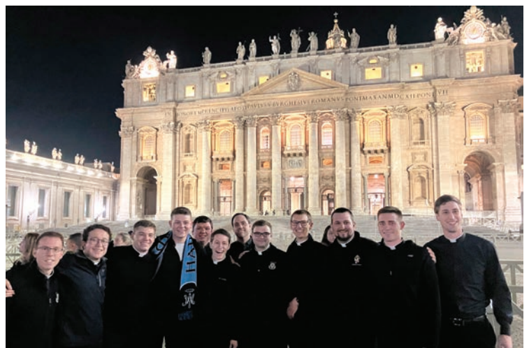
St. Peter's Basilica provides a stunning backdrop at night.