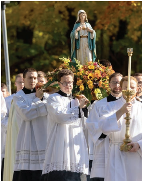
The Seminary's annual Marian procession takes place on a glorious October day.