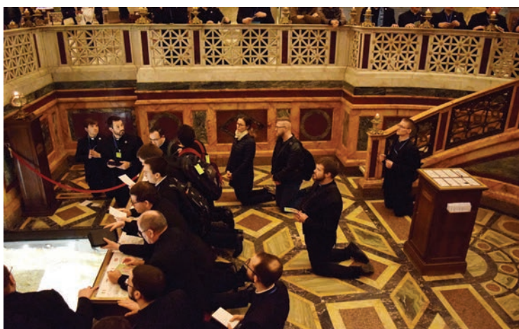
Praying at the tomb of the apostle St. Paul is deeply moving.