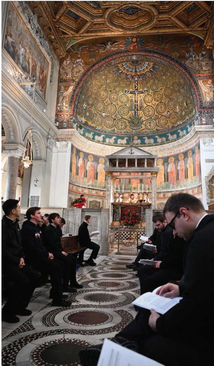
The beautiful Basilica of St. Clement is an inspiring site for Holy Mass.