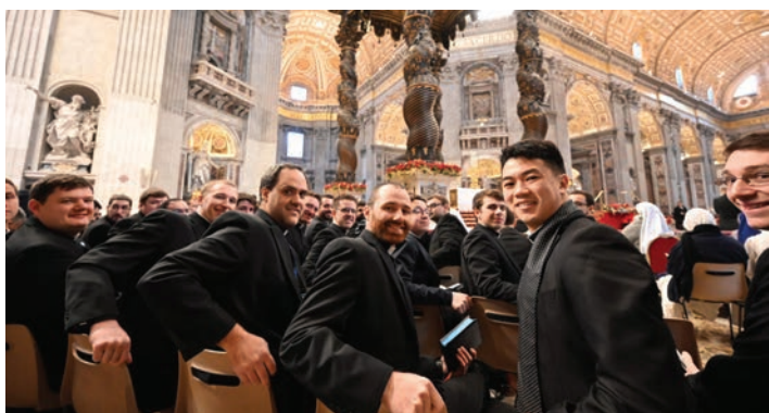
Our group arrives three hours early to get good seats for the Jan. 1 Mass with Pope Francis.