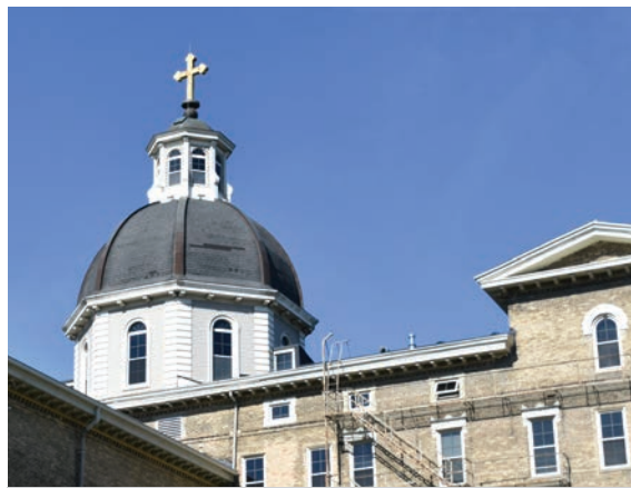
Henni Hall's iconic dome needs extensive repair work, and the entire building needs a new roof.

Firmly rooted in what God is doing in the present, we are also looking ahead as an institution.