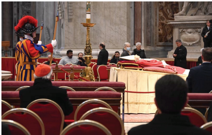
Cardinal Harvey (in the red zucchetto) happens to be praying for Pope Benedict at the same time our group passes by the bier.