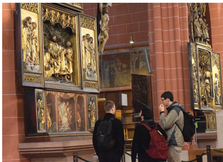
Seminarians explore churches in Frankfurt.

Returning to Rome, they attended Mass with Pope Francis on the Solemnity of Mary, the Mother of God. They also prayed the Angelus with him in St. Peter's Square. Our men were among the first to view Pope Benedict's body lying in state in the Basilica of St. Peter. The following day, they were invited to participate in a Requiem Mass with Timothy Cardinal