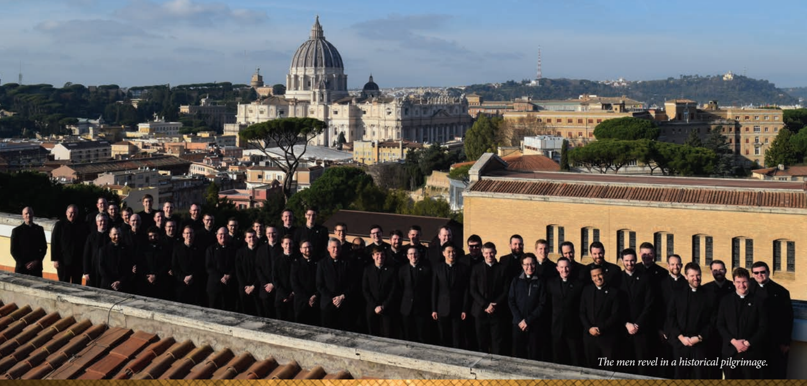
The men revel in a historical pilgrimage.