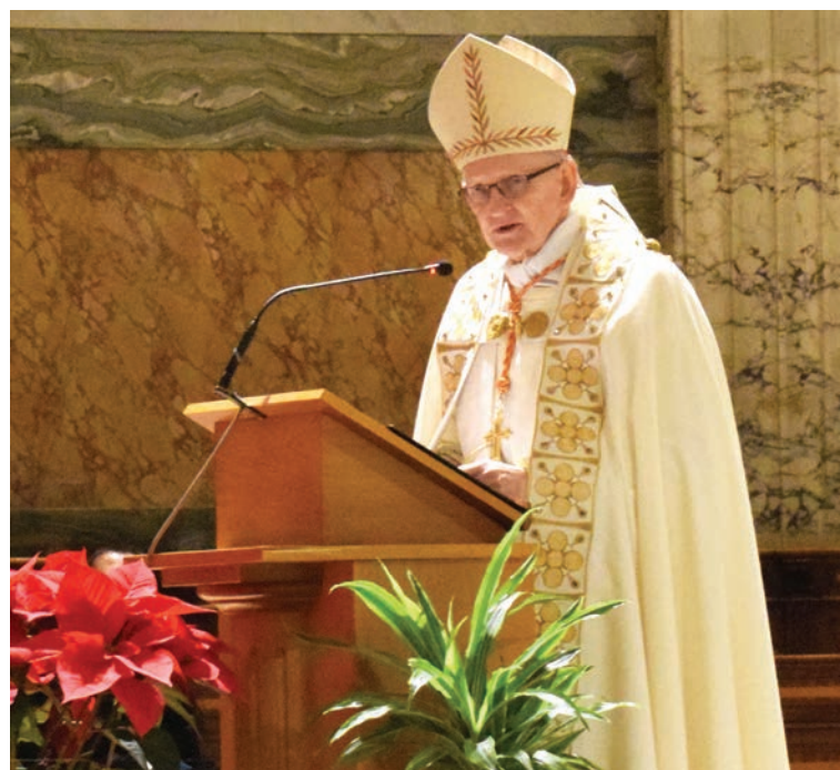
Cardinal Harvey preaches to the seminarians during vespers at St. Paul Outside the Walls.