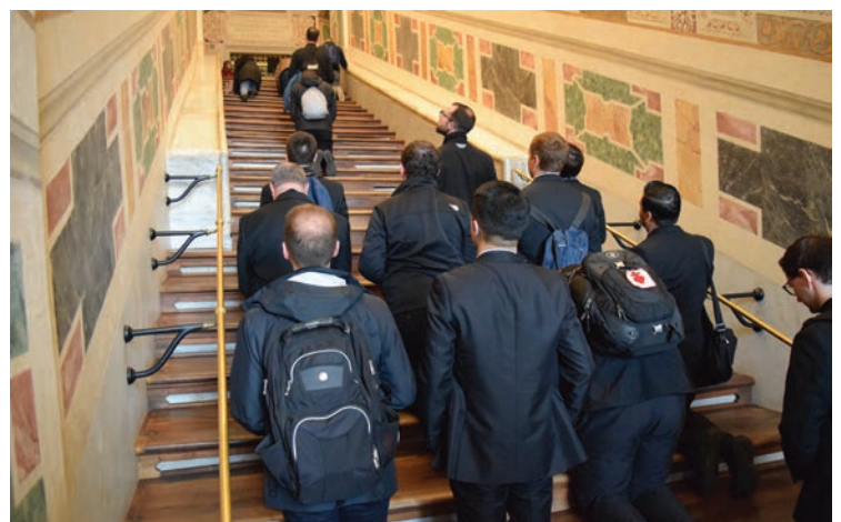
Seminarians climb the Scala Sancta on their knees. These are the stairs that Jesus climbed on his way to Pontius Pilate.