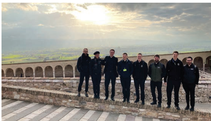
The first stop in Italy — finally! — is beautiful Assisi.

One final highlight, among so many other sights and sounds, was a private tour of the Vatican Museums. Our men prayed in the Sistine Chapel with only their group present in the beautiful, sacred space. It was truly a remarkable pilgrimage.