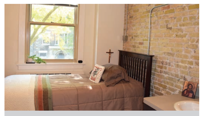
Cream City Brick walls are left exposed in many of the new student rooms in Meyer Hall.