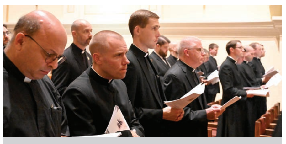
Over 100 priests come together for Evening Prayer.