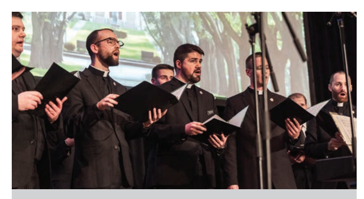
The Schola Cantorum offers beautiful hymns of praise.