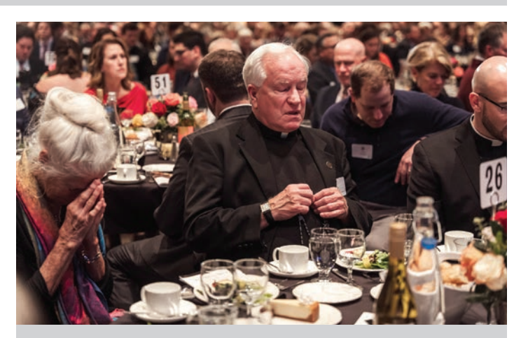
Two thousand people pray a decade of the rosary together.