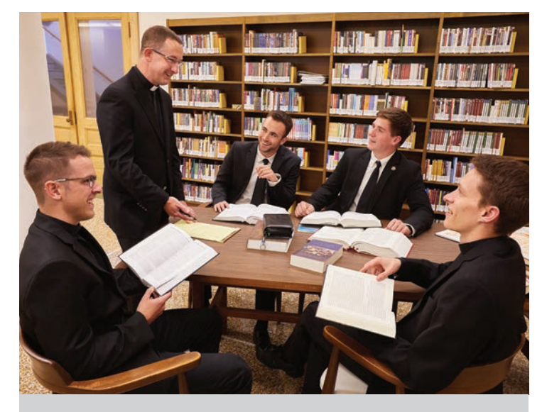
Salzmann Library is a popular place for seminarians to meet for small group or independent study.

On the other side of campus, work also began on Salzmann Library. This treasure, with its impressive column façade, was built in 1906 as a 50th anniversary gift from alumni priests. It features terrazzo floors and an outstanding view of our woods, not to mention an impressive collection of books. The library needs functional updates with creating more study space for all our seminarians as the first priority. This summer's initial phase included taking down an interior wall to open the first floor and repair of the terrazzo floor. Generous benefactors have come forward to donate both time and money to get the work done.