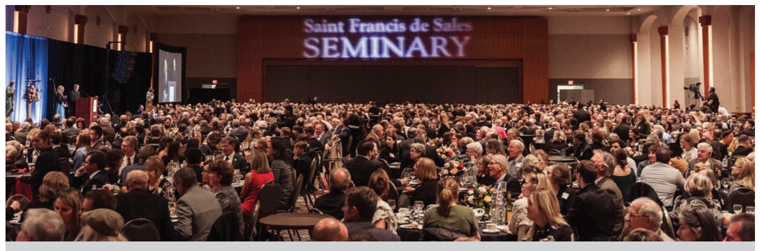
The sold-out ballroom is a testament to the dedication of our benefactors.