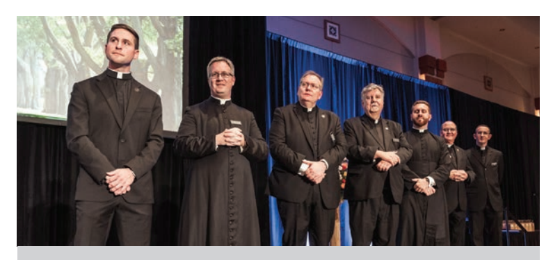
The formation faculty are brought onstage as Fr. Strand explains the formation program.