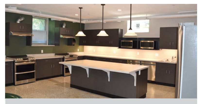
Meyer Hall's kitchen features a refinished terrazzo floor, new cabinets, and appliances.