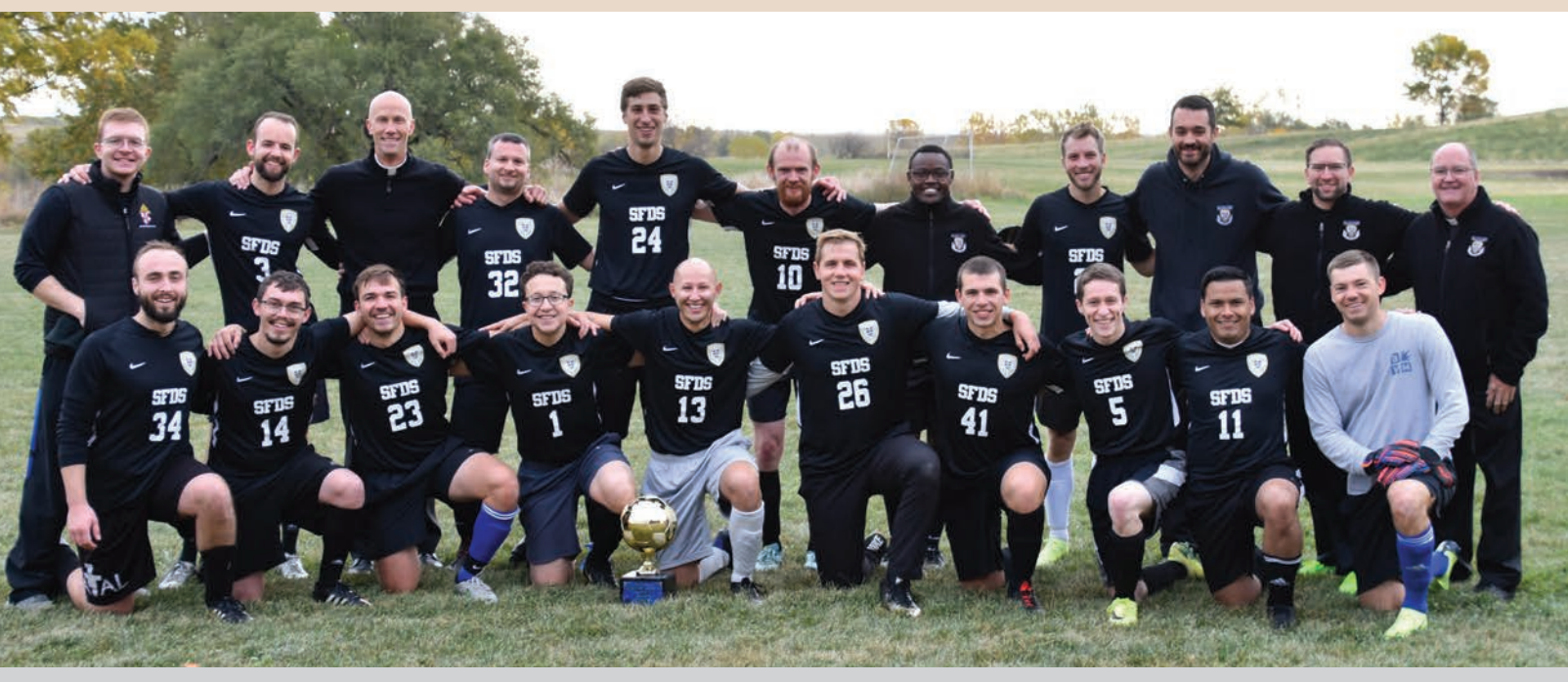
Our men celebrate two first place finishes, two years in a row!

For more information or to support the mission of Saint Francis de Sales Seminary, visit our website at www.sfs.edu. Like us on Facebook to keep up to date with the latest news and photos. (414) 747-6400