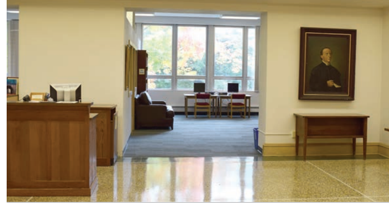
The library's newly wide-open first floor boasts a splendid view of fall foliage and a gleaming terrazzo floor.