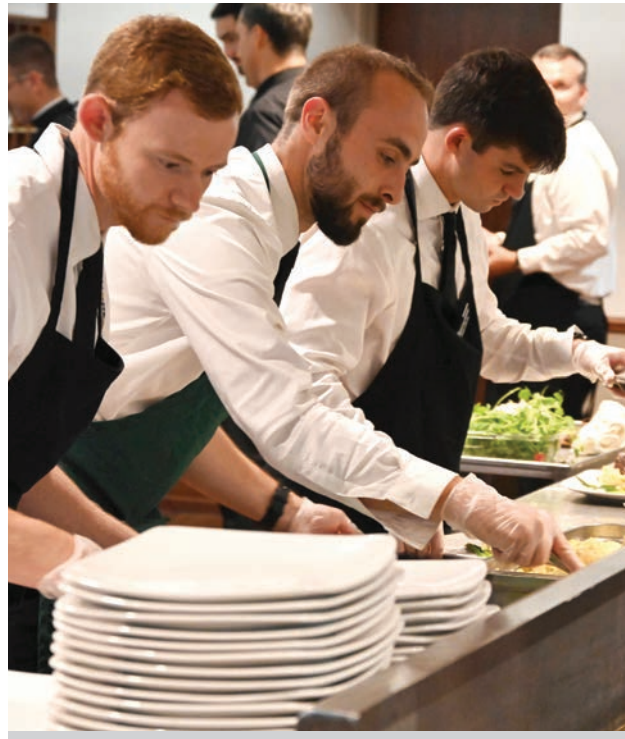
Seminarians help to make the installation events go smoothly.