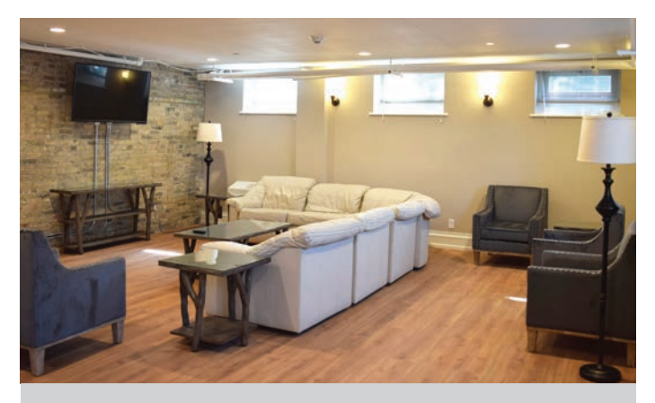
Meyer Hall's basement lounge has original hardwood floors and a Cream City Brick wall.