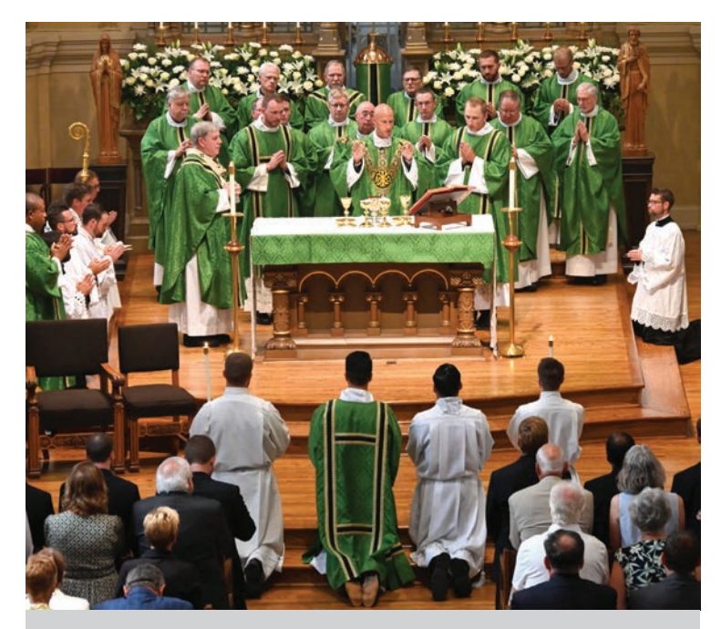
Over 200 people worship together during the Mass in Christ King Chapel.

We have all come to celebrate the installation of the 20th rector of this Seminary. But he has invited us to come to celebrate the gift of the priesthood of Jesus Christ.