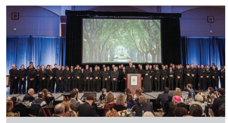
80 seminarians is a beautiful sight for the faith-filled crowd!