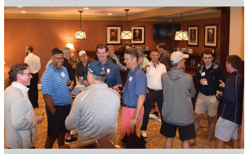
The enthusiastic golfers have a great time connecting with friends at the Pallium Scholarship Benefit.